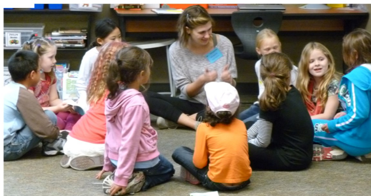
Immersion learning with songs, drama, and practical dialogue is the most effective way to learn a foreign language.

"I like EVERYTHING about French ." -Thomas (Grade 4)